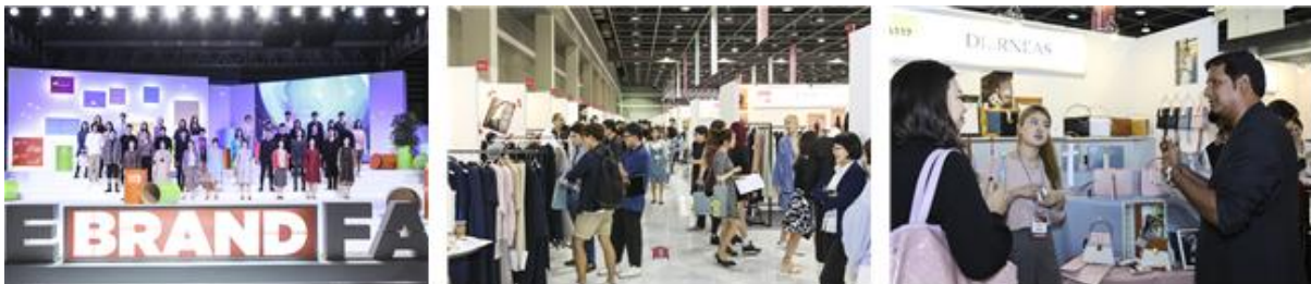
< 2018 S/S Indie Brand Fair >