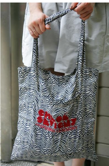
● CHLOË SEVIGNY FOR OPENING CEREMONY