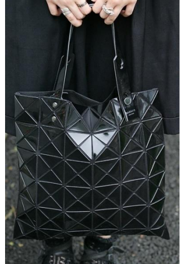
●BAO BAO ISSEY MIYAKE