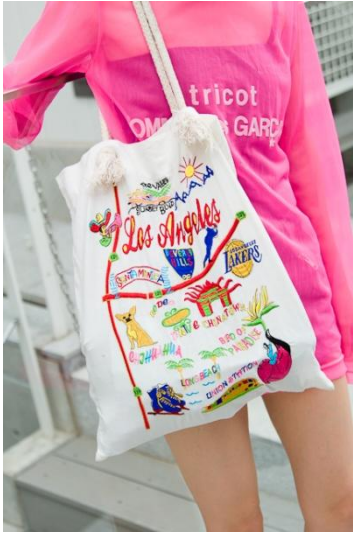
● n° 44