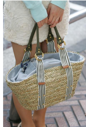
●chocol raffine robe