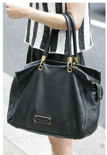
●MARC BY MARC JACOBS