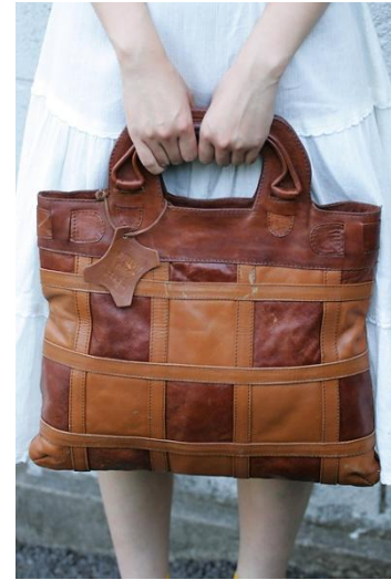
● BOOTS 'N BAGS