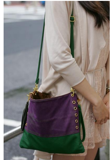
● ROYAL PARTY