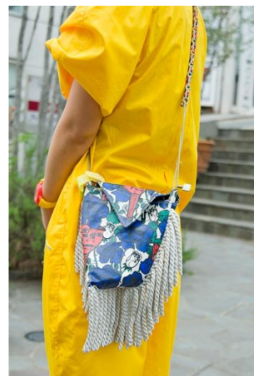
● LONDE CIGARETTES