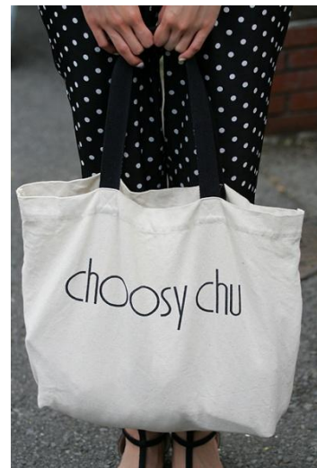
● choosy chu