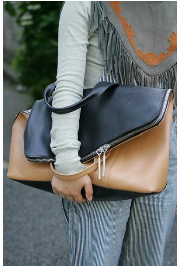
● 3.1 Phillip Lim