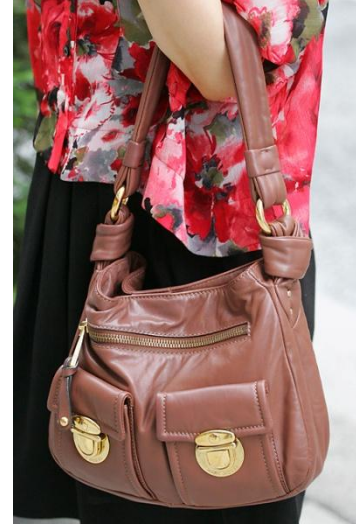
●MARC BY MARC JACOBS