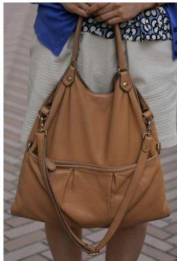
●BEAUTY & YOUTH UNITED ARROWS