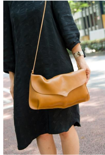
● bulle de savon