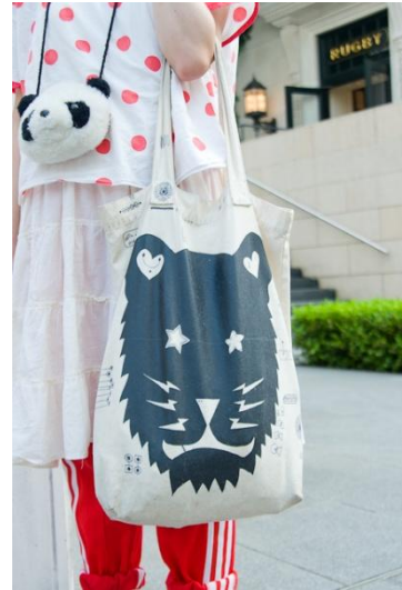
●ZAKEE SHARIFF & MAKE ART YOUR ZOO