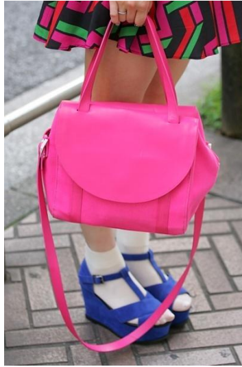
●KATE SPADE SATURDAY