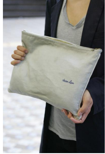
● steven alan