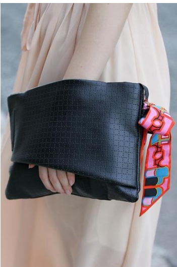
●PUMA by hussein chalayan