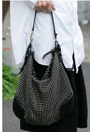
● BURBERRY PRORSUM