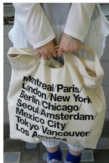
● American Apparel