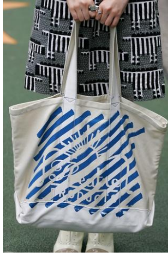
● THEATRE PRODUCTS