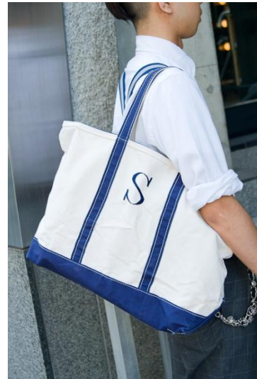
● Santa Monica