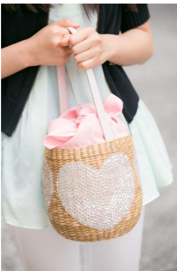
●HOUSE OF ANLI