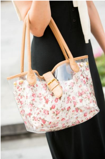
●Fabulous CECIL McBEE