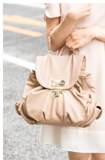
●JILL by JILLSTUART