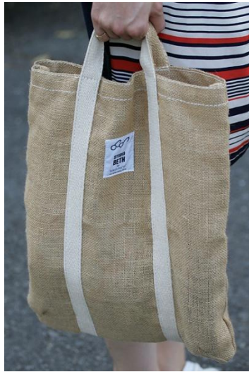
● STUDIO BETH for Gallery & Shop "DO"