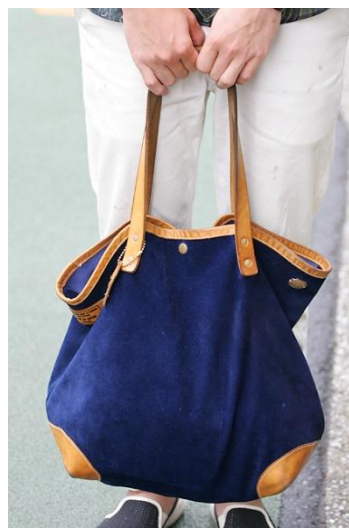
● THE SUPERIOR LABOR