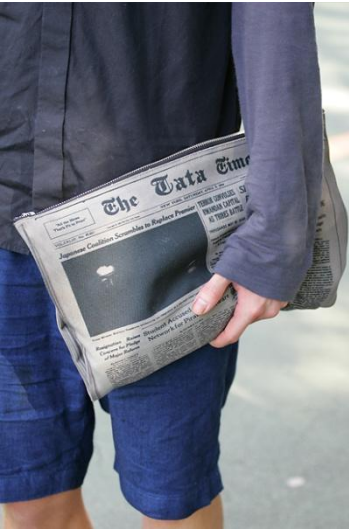
●TALKING ABOUT THE ABSTRACTION