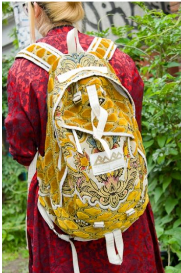
●banal chic bizarre×BLONDE CIGARETTES