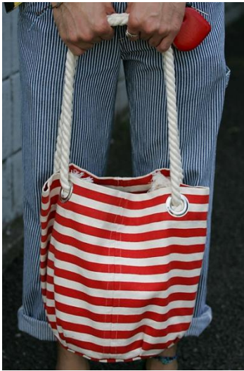
● HOMES' UNDERWEAR