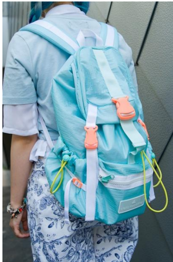
● adidas by stella mccartney