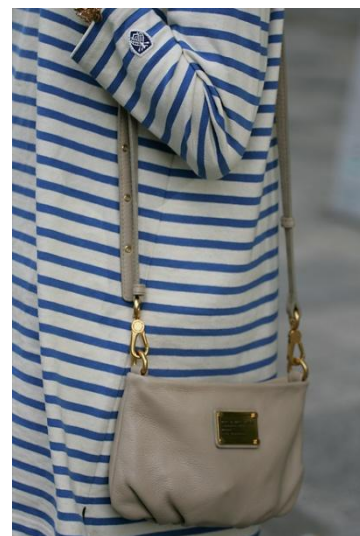
●MARC BY MARC JACOBS