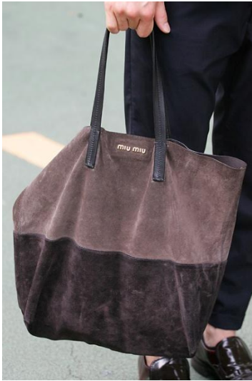
● miu miu