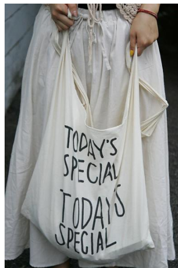
● TODAY'S SPECIAL