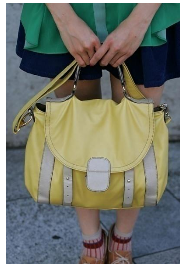
● FREE'S SHOP