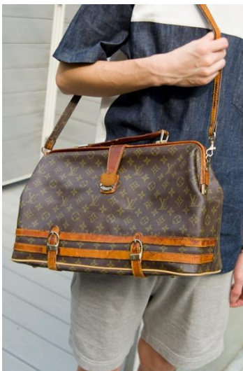
● LOUIS VUITTON