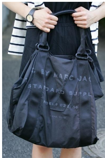
● MARC BY MARC JACOBS