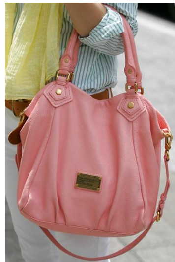
●MARC BY MARC JACOBS