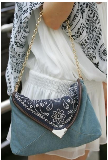
●WHO'S WHO Chico