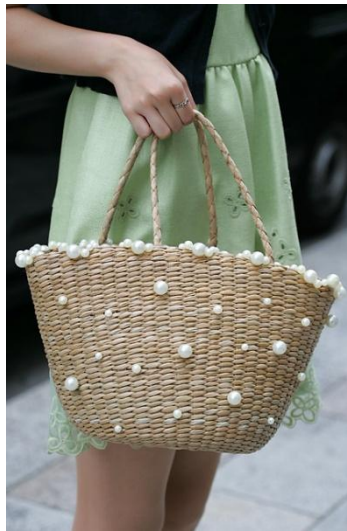
●Bon mercerie de anatelier