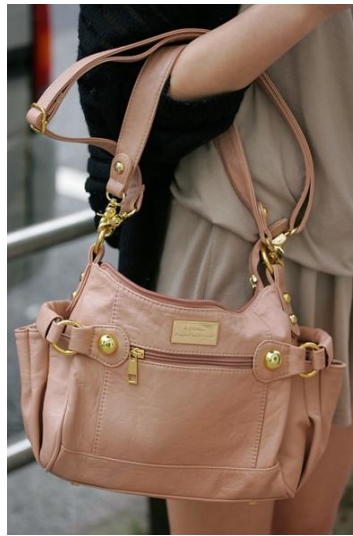
● SHIBUYA 109