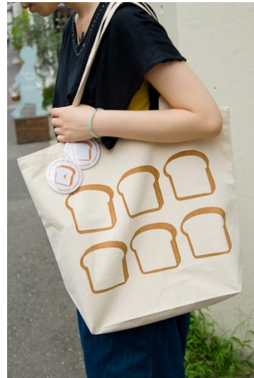
● proto (egg) product project