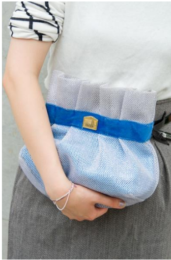
● ensemble THEATRE PRODUCTS