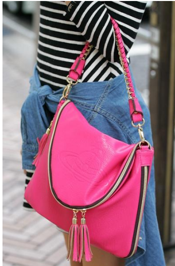
● Vivienne Westwood