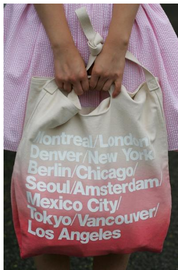
● American Apparel