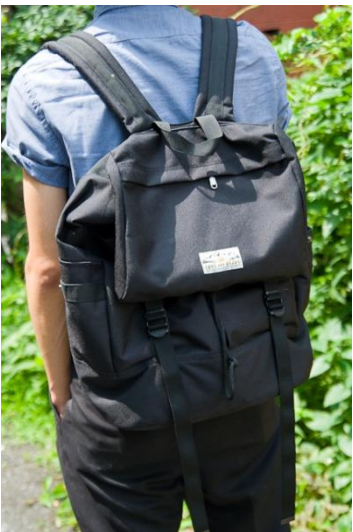
●ENDS and MEANS