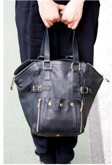
● SAINT LAURENT