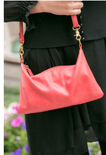
●Cours de Couleur