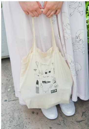
●Emi meets made in HEAVEN