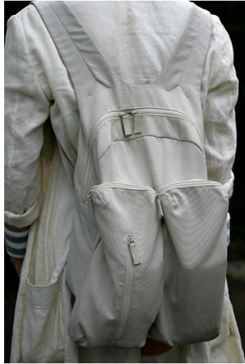
● HELMUT LANG