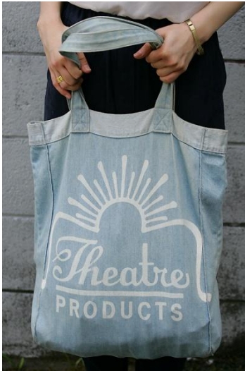
● THEATRE PRODUCTS