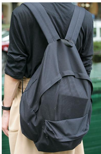
● COMME des GARÇONS HOMME PLUS