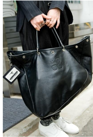
● COMME des GARÇONS