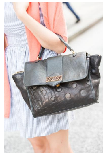
●MARC BY MARC JACOBS