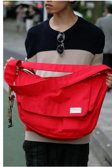
●PEGLET × .efiLevol