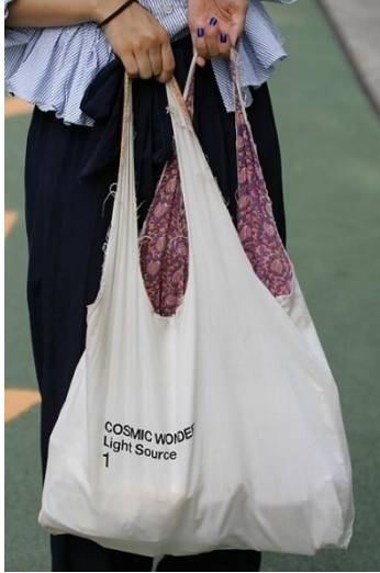
● COSMIC WONDER Light Source