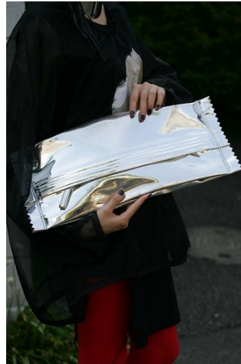
● Maison Martin Margiela with H&M