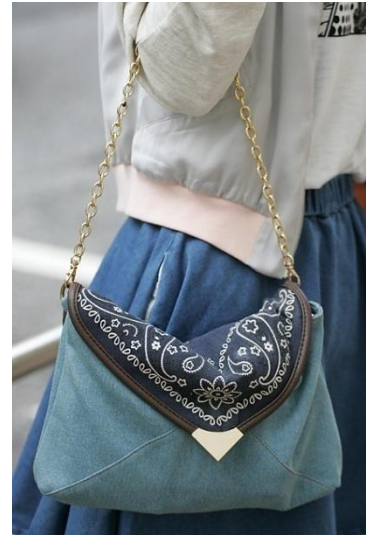
● WHO'S WHO Chico