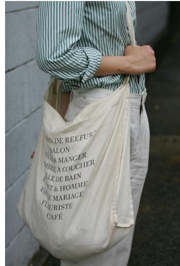
● MAISON DE REEFUR