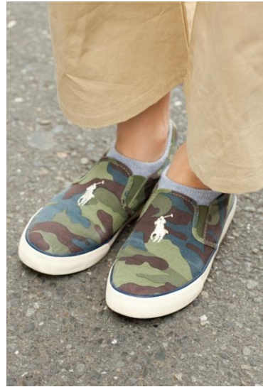
●POLO RALPH LAUREN