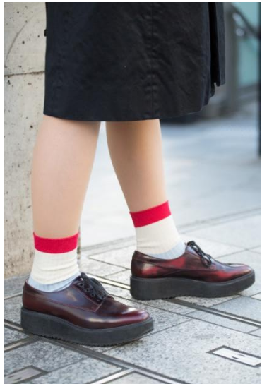
●CHARLES & KEITH