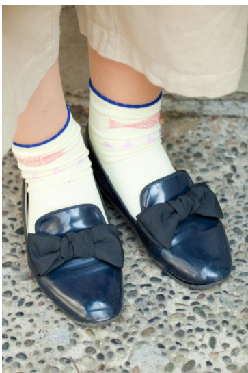
●E hyphen world gallery