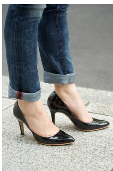
●BARNEYS NEW YORK