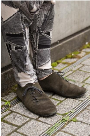
● The Viridi-anne