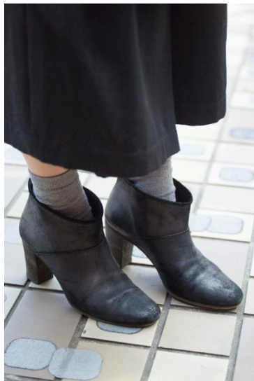
●Maison Martin Margiela