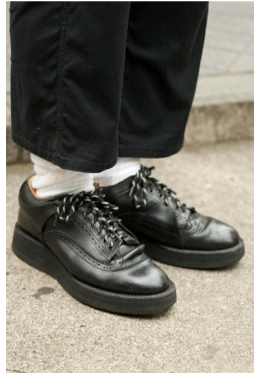
●foot the coacher