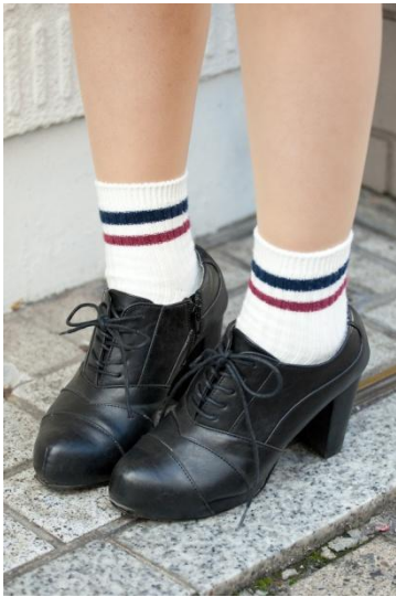
●AZUL by moussy