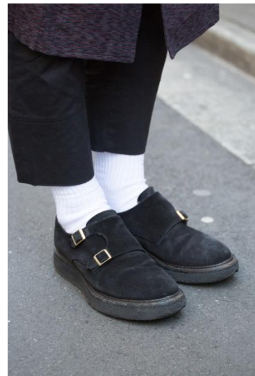
●KIDS LOVE GAITE