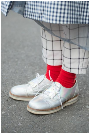
●I am I