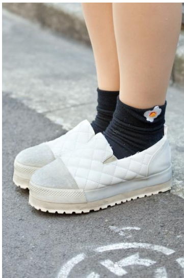
●I am I