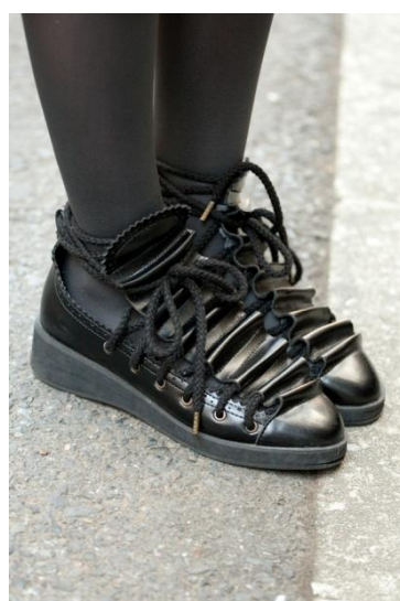
●Dolly & Molly