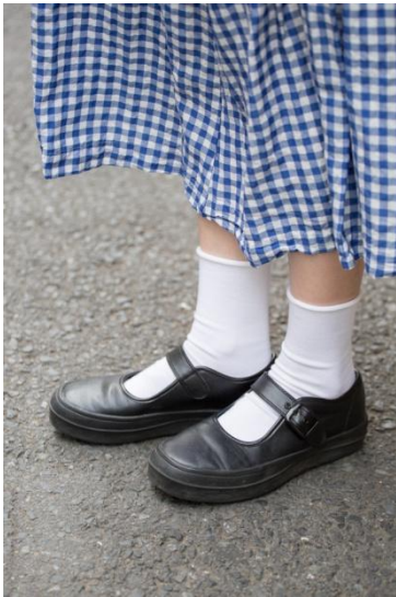
●bulle de savon