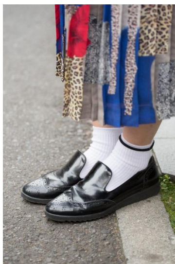
●BEAUTY & YOUTH UNITED ARROWS