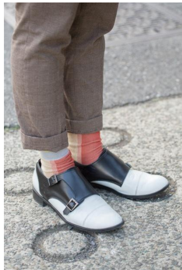
●BEAUTY & YOUTH UNITED ARROWS