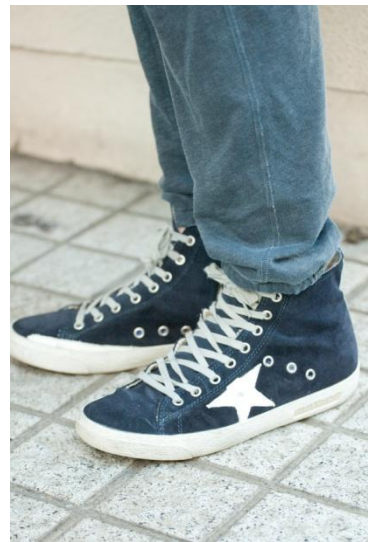
●GOLDEN GOOSE DELUXE BRAND