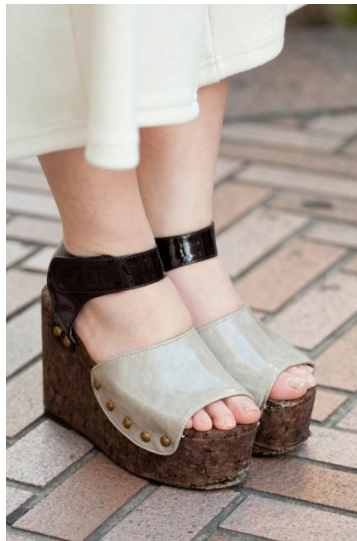
●made in HEAVEN