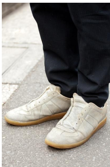
●Maison Martin Margiela