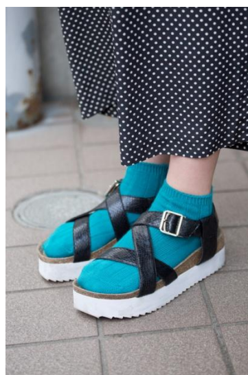
●apart by lowrys