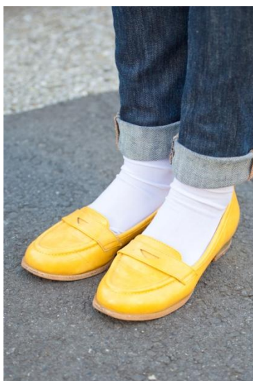
●l'atelier du savon