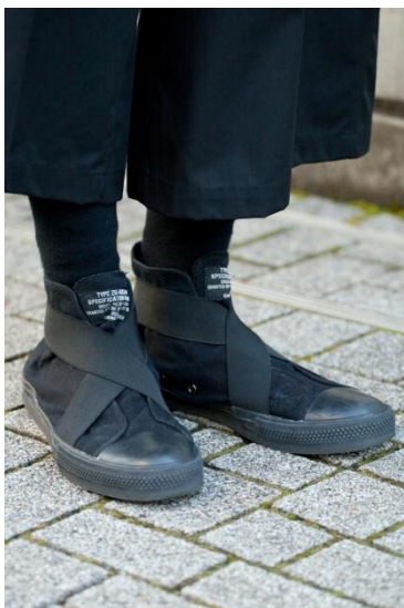
●CABANE de ZUCCa