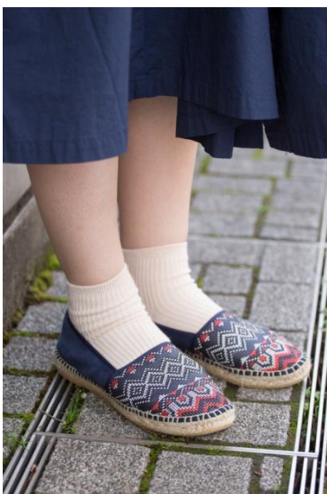
●l'atelier du savon