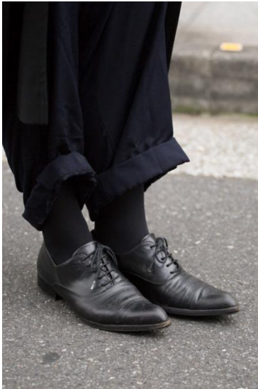
● JIL SANDER