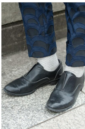
● BEAUTY & YOUTH UNITED ARROWS