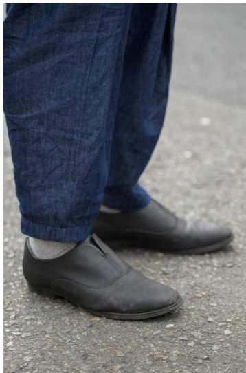
●earth music & ecology