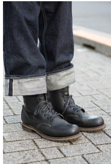
●RED WING SHOES