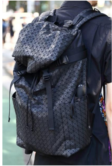
●BAO BAO ISSEY MIYAKE