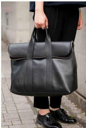
●3.1 Phillip Lim