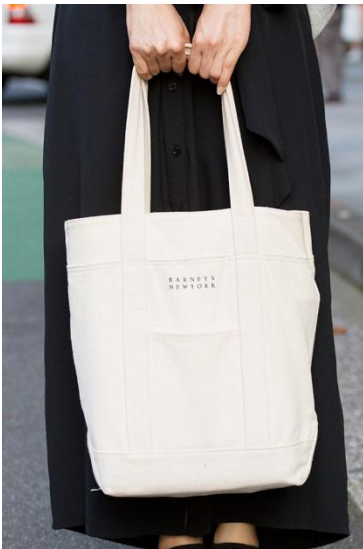
● BARNEYS NEW YORK