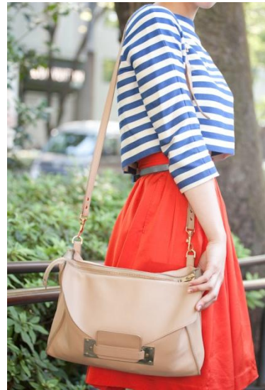
● SOPHIE HULME