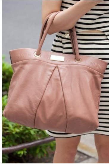
●MARC BY MARC JACOBS