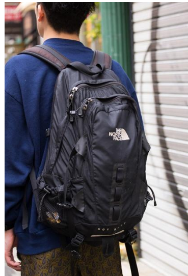
● THE NORTH FACE