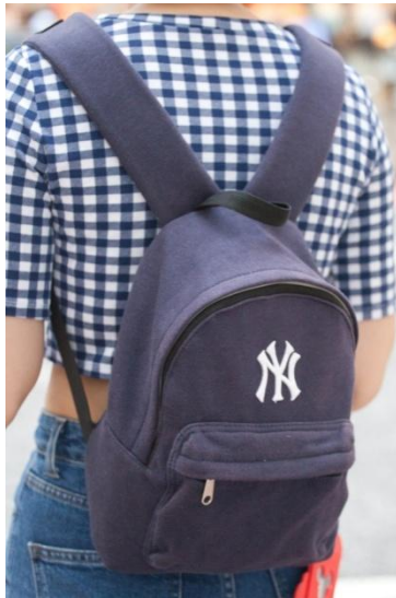
●MAJOR LEAGUE BASEBALL