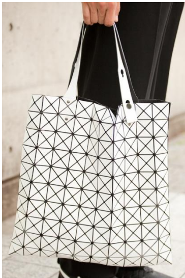
●BAO BAO ISSEY MIYAKE