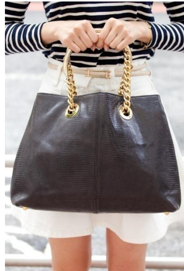
●paola del lungo