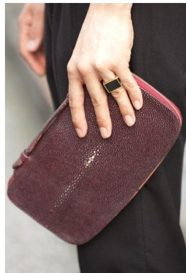
● around the shoes