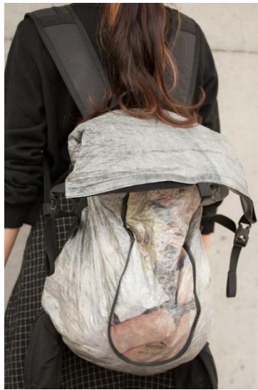
●PUMA by MIHARAYASUHIRO