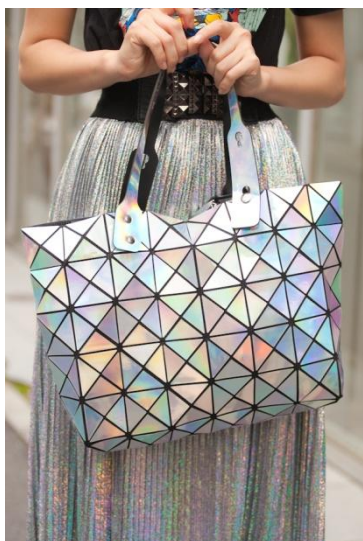
● BAO BAO ISSEY MIYAKE