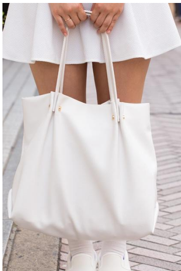
●mikoa LOWRYS FARM