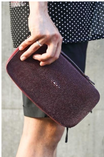
●around the shoes