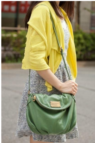
●MARC BY MARC JACOBS