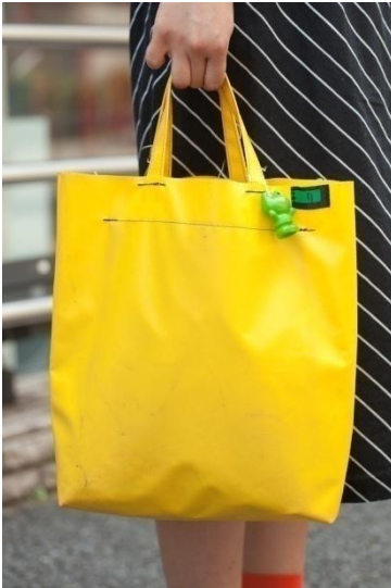
●I am I