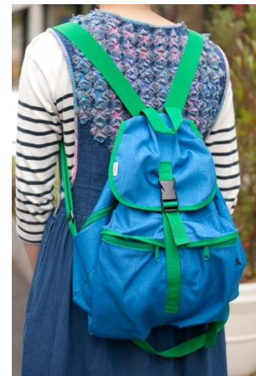
● cache cache