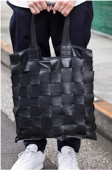
● AISTE NESTEROVAITE