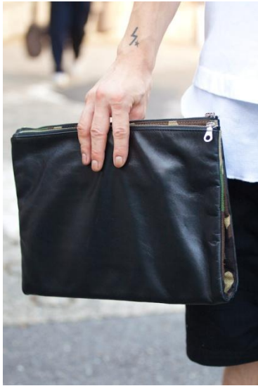
●SHIPS JET BLUE