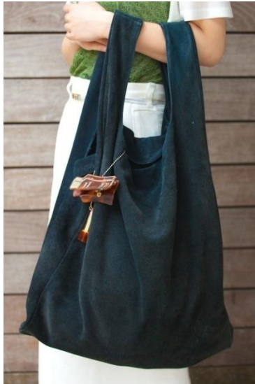
●MM6 maison martin margiela