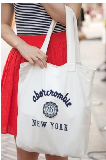
●Abercrombie & Fitch