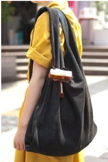
●MM6 maison martin margiela