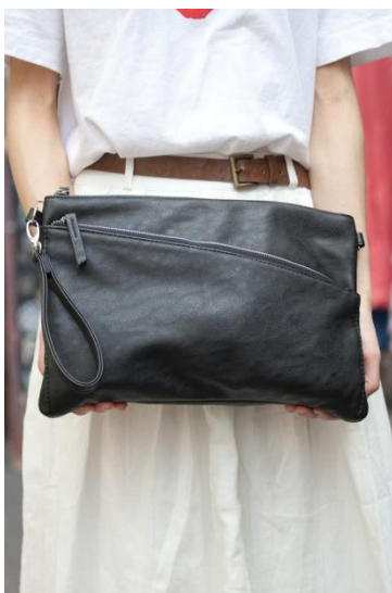
●AZUL by moussy