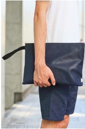
●MAISON & VOYAGE